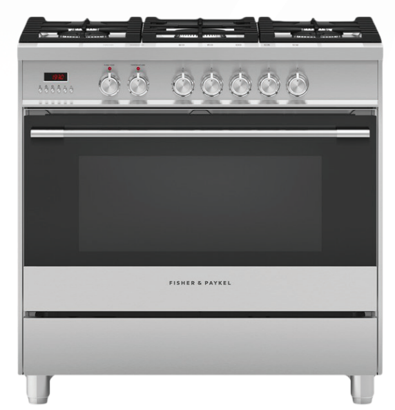
Fisher & Paykel 900mm freestanding electric oven