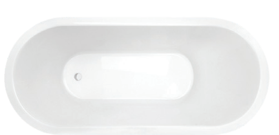
Decina Uno Oval Bath 1700mm Inset