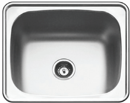
Abey Project 45L Flushline Laundry Tub

Choose from the Arista standard range of tiles with sizes up to 600 \times 600 .