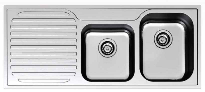
Clark Monaco 1 & 3/4 bowl stainless steel sink with drainer from Arista standard range