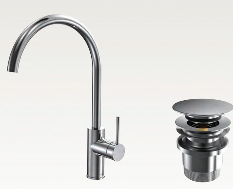
Parisi Envy Arch Sink Mixer

Choice of Parisi Chrome finish sink mixer from Arista standard.