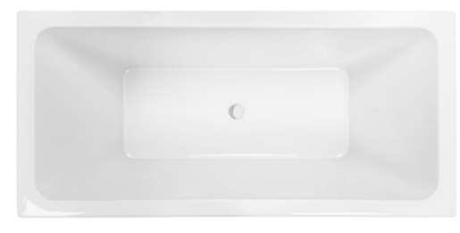
Decina Carina Island Bath 1675mm